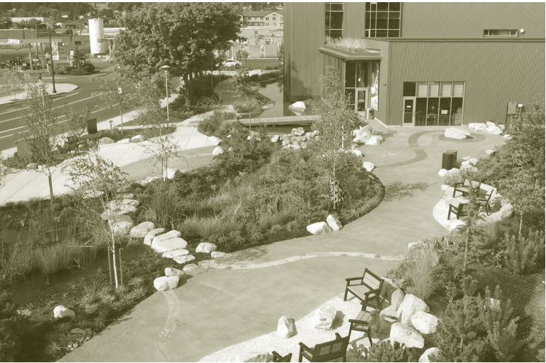
Special Applications: Artistic Merit: East Bay Public Plaza