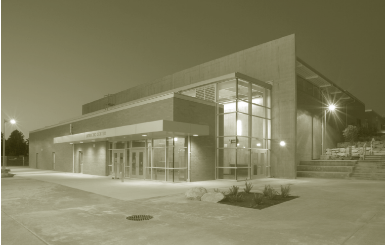
Architectural Concrete: Lake Washington High School -Commercial / Non Commercial -Stamped, Colored -Interior/Exterior -Stained Decorative -Shot Crete