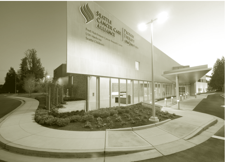
Cast In Place Category: SCCA Procure Center - Concrete Frame Structures - Parking Garages

46th Annual Awards Banquet Bellevue Hyatt Regency • Thursday, May 8, 2014