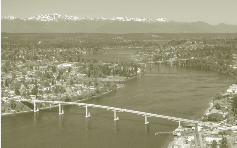
Manette Bridge Replacement Concrete Paving: Streets/Roads/Intersections etc.

Tilt-Up Category: - Industrial - Non Industrial Public Works: - Bridges/Tunnels - Infrastructure - Other