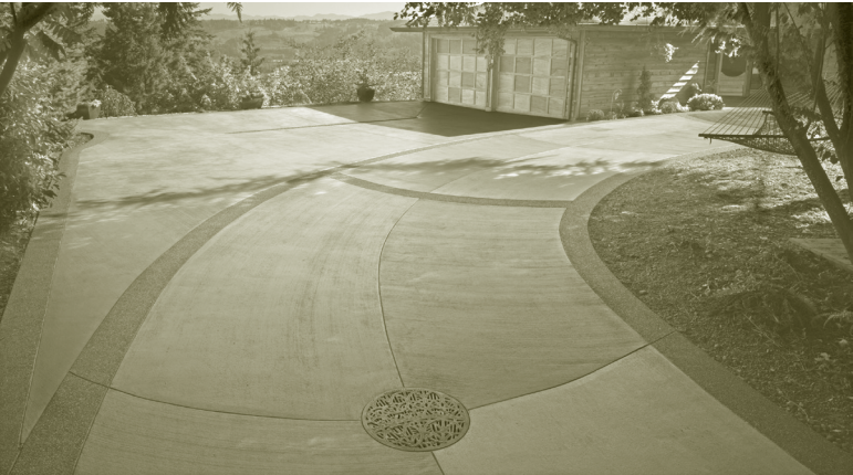
Residential Category: Sprague Driveway - Residential Structures - ICF Construction - Residential Decorative Interior - Exterior Concrete: Driveways, Patios, etc.